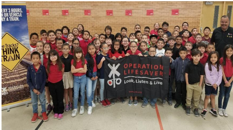
Picture from Ysleta Independent School District TXOL presentation

With new rail comes new crossings and new dangers for these communities. Keep your eyes out for presentation opportunities we can take advantage of to keep these communities safe. More information can be found at: http://www.texrail.com/